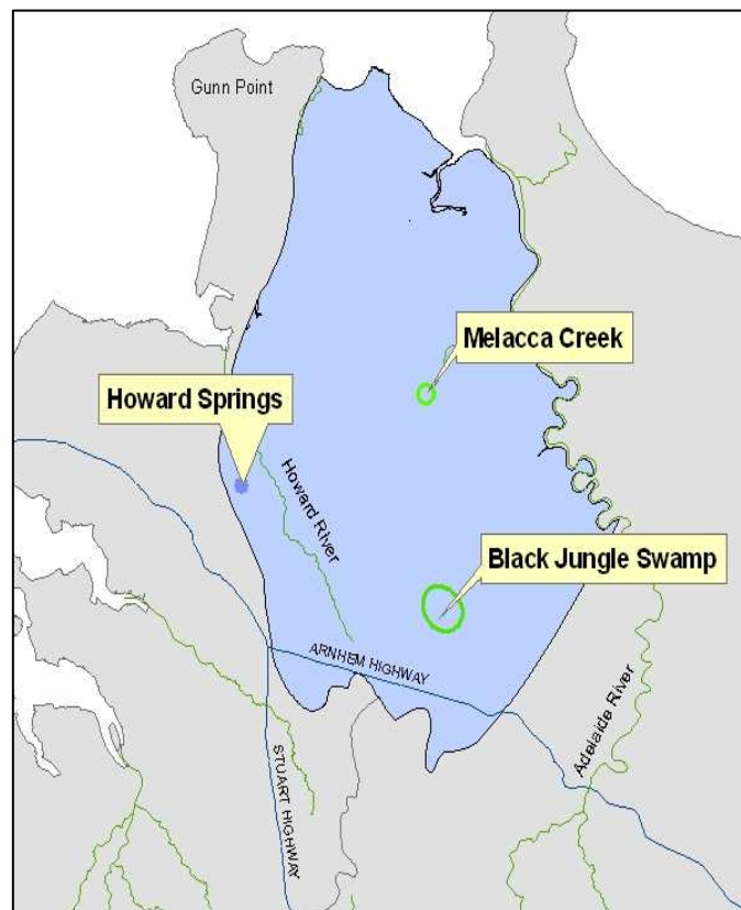
Figure 1. Map showing the boundaries of the Howard East aquifer, also known as the Koolipinyah Dolomite Aquifer

The Howard East aquifer is relatively small yet high yielding aquifer that borders Darwin and Palmerston. Soon to be declared the Howard East Water Allocation Planning Area (HEWAPA), the area captures much of the peri-urban community in Howard Springs and Humpty Doo, and several lagoons systems that drain the Howard River Catchment. Located approximately 20 kilometres from Darwin, the border extends south from Howard Springs and follows roughly the same direction as the Arnhem Highway, before cutting north at Humpty Doo and meeting the Adelaide River. This forms the western boundary of the aquifer until it meets the sea close to Gunn Point.